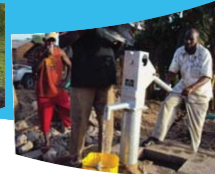
New shallow wells

targeting pastoralist areas in 7 villages in afmdow-one activity per village.