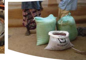
Seeds distribution (Beans,Sorghum,maize)