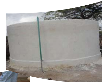
Doboly borehole Masonary tank after the rehabilitation

includes water trucking, boreholes support, construction of latrines for IDPs transit centres, Hygiene promotion activities and non food items distribution.