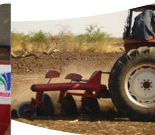
Jilib farming support – ECHO funded 2010 -2011